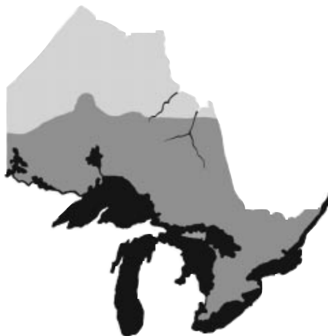
RANGE OF EASTERN WHITE CEDAR IN ONTARIO

In moist areas, white cedar is commonly found with eastern white pine, yellow birch, eastern hemlock, silver or red maple, black ash and white elm. In sphagnum bogs, it is often found with black spruce and tamarack. On drier sites it can often form dense, pure stands.